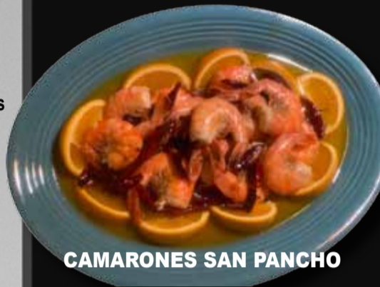
CAMARONES SAN PANCHE