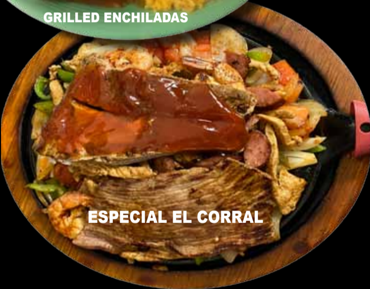
ESPECIAL EL CORRAL