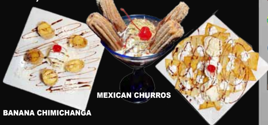
SOPILLA WITH ICE CREAM