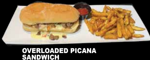
OVERLOADED PICANA SANDWICH