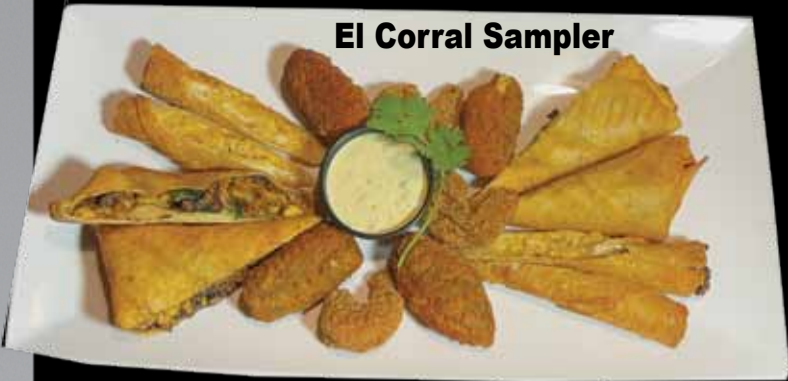
El Corral Sampler