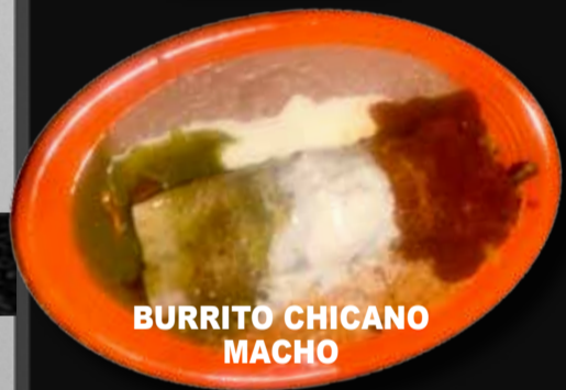
BURRITO CHICANO MACHO