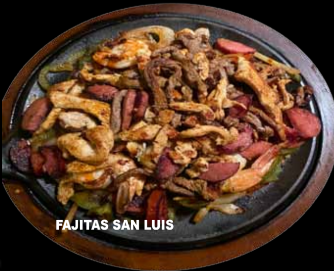
FAJITAS SAN LUIS